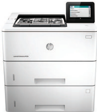
HP LaserJet Managed M506xm