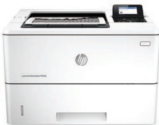
HP LaserJet Managed M506dnm

HP Managed MFPs and printers are optimized for managed environments. Offering increased monthly page volumes and fewer interventions, this portfolio of products can help reduce printing and copying costs. See your HP Authorized Reseller for details.