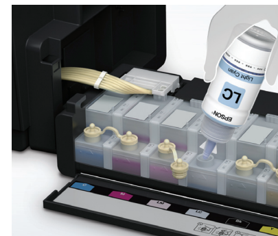
Specially fitted tubes ensure reliable ink flow without leakage

Epson's original EcoTank system is engineered for easy, mess-free refills. The special tubes in the printer are designed to ensure smooth and reliable ink flow at all times.