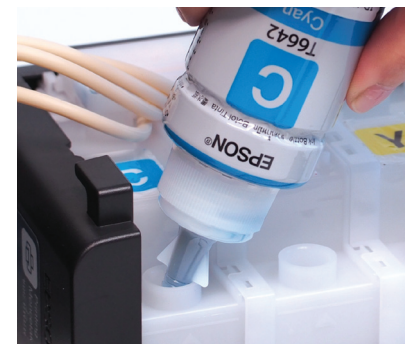
Smart tip design for easy, mess-free refills